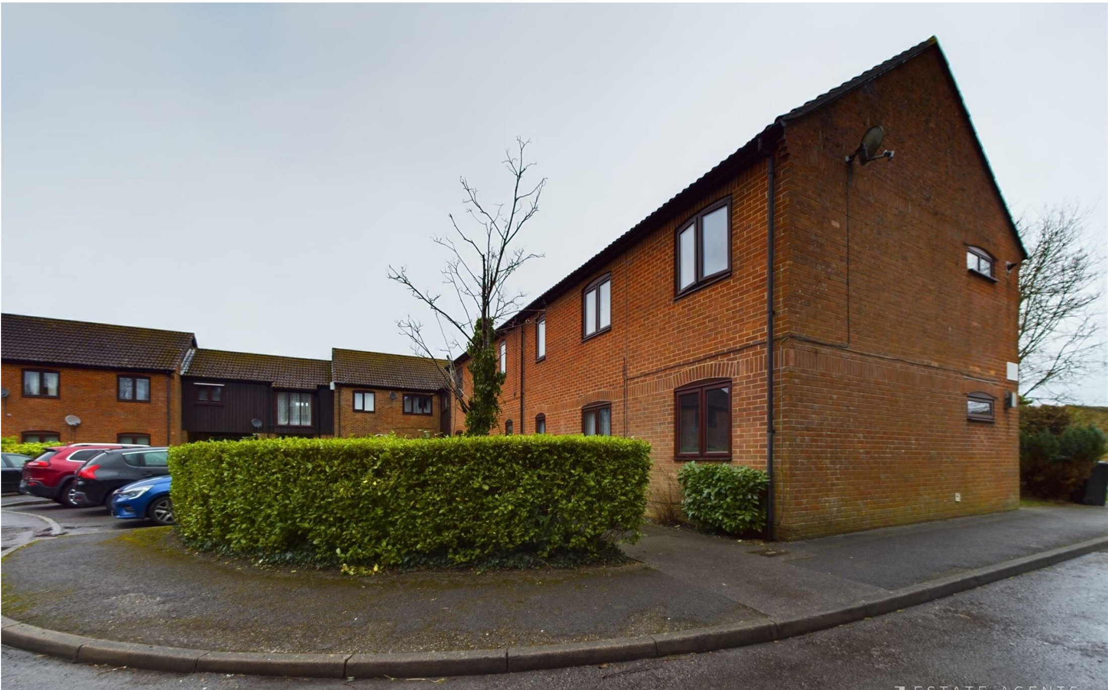
Alpine Court, Basingstoke, RG22 5EF